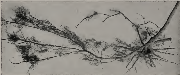
Root System of Once-Transplanted Tree

THE natural tendency of roots, left to themselves, is to spread